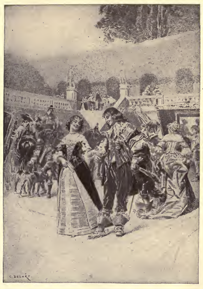
The Chevalier was so agreeable and diverting, that he made his mistress almost die with laughing. —p. 38