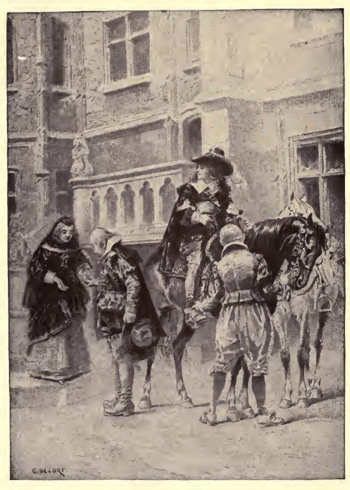
"She suffered me to depart, under the protection of the Lord and the sage Brinon." -p. 20